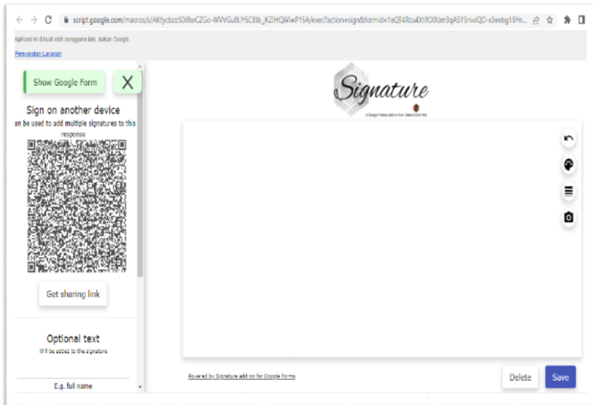
Picture 2. Google Form Presence With Signature