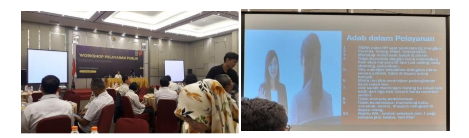
Figure 1. Public Service Workshop Provided by the Secretary of the Special Region of Yogyakarta at the Burza Hotel Yogyakarta on 8 May 2024

In addition, for the development of civil servants resources, the government provides training to civil servants in charge of public services. Training activities are usually held by BKPSDM and proposed by the Population and Civil Registration Agency of Yogyakarta City as the village/kelurahan is an extension of Population and Civil Registration Agency. The participation of civil servants in training activities can have a positive impact on the organization, especially in relation to work quality (Maulidyah et al., 2019). Askari & Nugraha (2019) an increase in the capacity of the civil servants is expected to improve the quality of life of the civil servants. The participation of civil servants in training allows them to improve their skills in carrying out their duties (Hidayat et al., 2022; Nurrahman et al., 2021). Civil servants with adequate quality are considered to be able to adapt to technological developments, which can make the public service process easier (Rahmadanita, 2022).