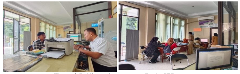
Figure 4. Public service process at Baciro Village

The researcher interviewed a resident of Baciro Village and the results showed that the public services provided by the village government are considered good, fast, clear, and free. This reflects service transparency. In addition, the Head of the Economy and Development Section of Baciro Village explained that public services are based on Mayoral Regulation No. 14 of 2023, which is a reference in the implementation of services and administrative handling. Supporting factors for the success of public services in Baciro Village are good cooperation between employees and the community, where people who comply with existing rules and requirements can speed up the service process. However, the inhibiting factors are customers preparing incomplete requirements and misunderstandings arising from inaccurate information about the rules, even though there has been socialization carried out by the village.