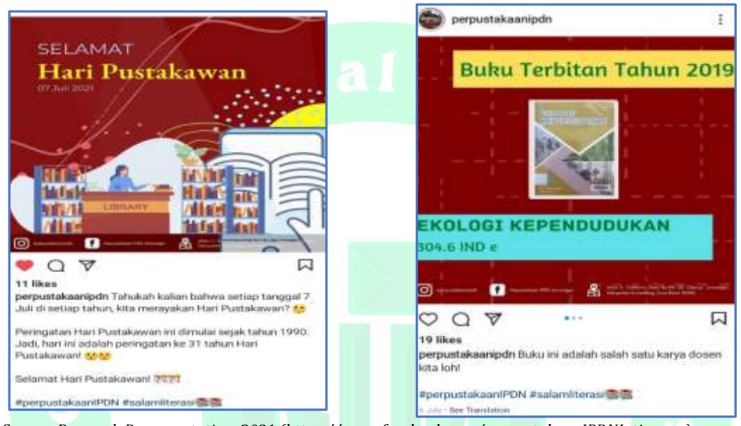
Figure 8. Promotions Activity by IPDN Library Facebook, 2021