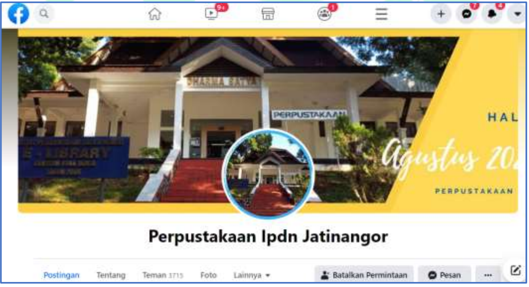
Figure 7. IPDN Library Facebook Display, 2021