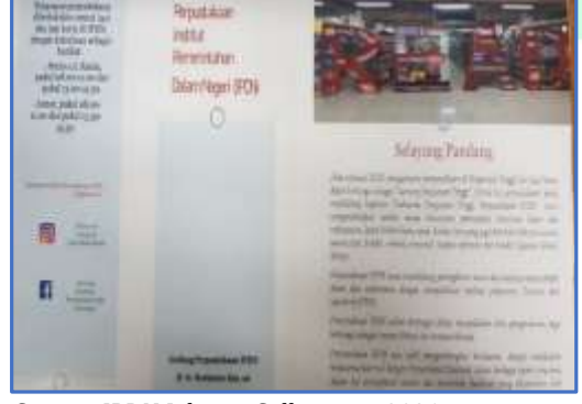
Figure 1. The Example of Brochure as a Promotion of Service Types and Library Collections

Referring to several promotional methods in the form of library information packaging, most of Praja who had been interviewed agreed that brochures were the most effective way for IPDN library to carry out promotion. Through brochures created by librarians and library managers, Praja as users can find out the types of services, library collections, and library profile. The example of brochures in IPDN library can be seen in Figure 1 and Figure 2 below.