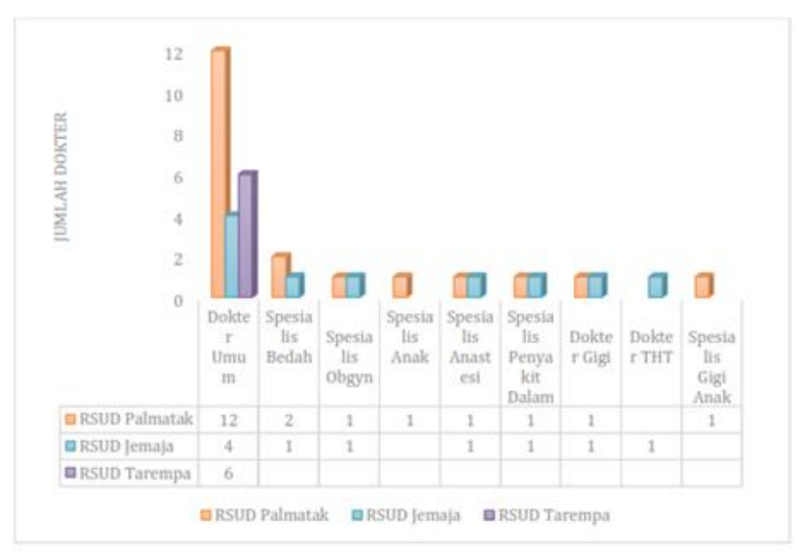
Figure 4. The Number Of Doctors In Anambas Islands Regency (2019)

Regional Public Hospital Development Policy has a good Political Will, namely to increase access to referral health services to the community and reduce patient referrals to other locations. However, the researcher found indications that the development of the hospital was too forced, in addition to the fact that the building condition did not meet the standards as well as the lack of adequate health workers.