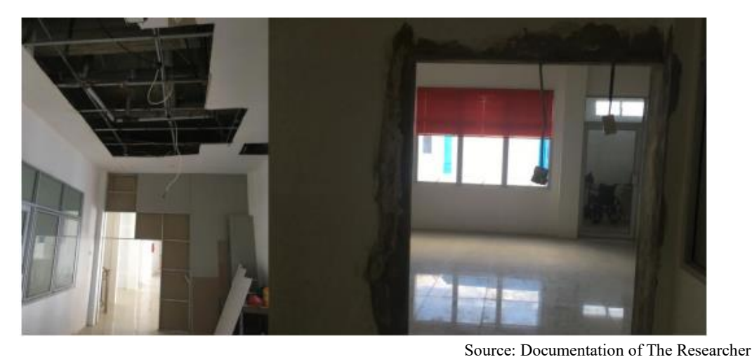
Figure 3. Existing Condition of The Regional Public Hospital in 2019